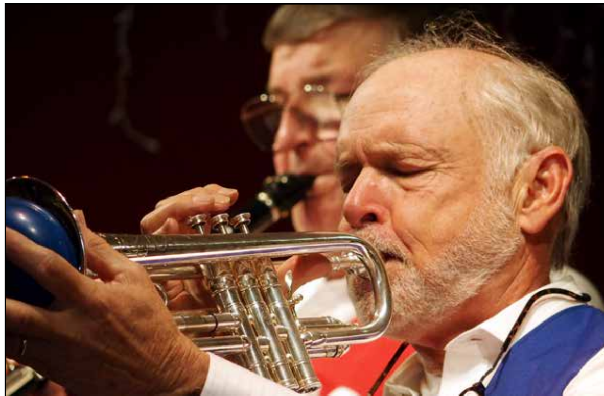
The Flying Eagles will be the featured band in October.