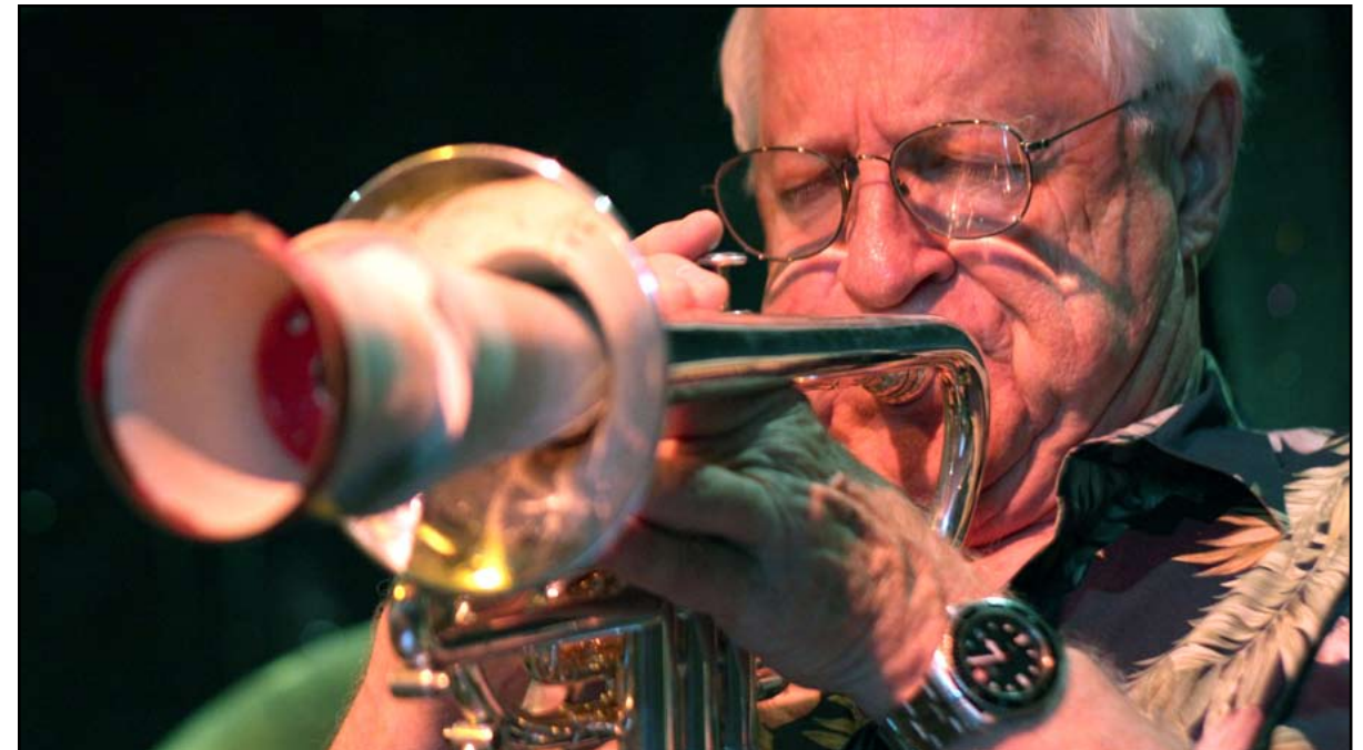
(Presidents' Message continued)

New Orleans Jazz Club of Northern California