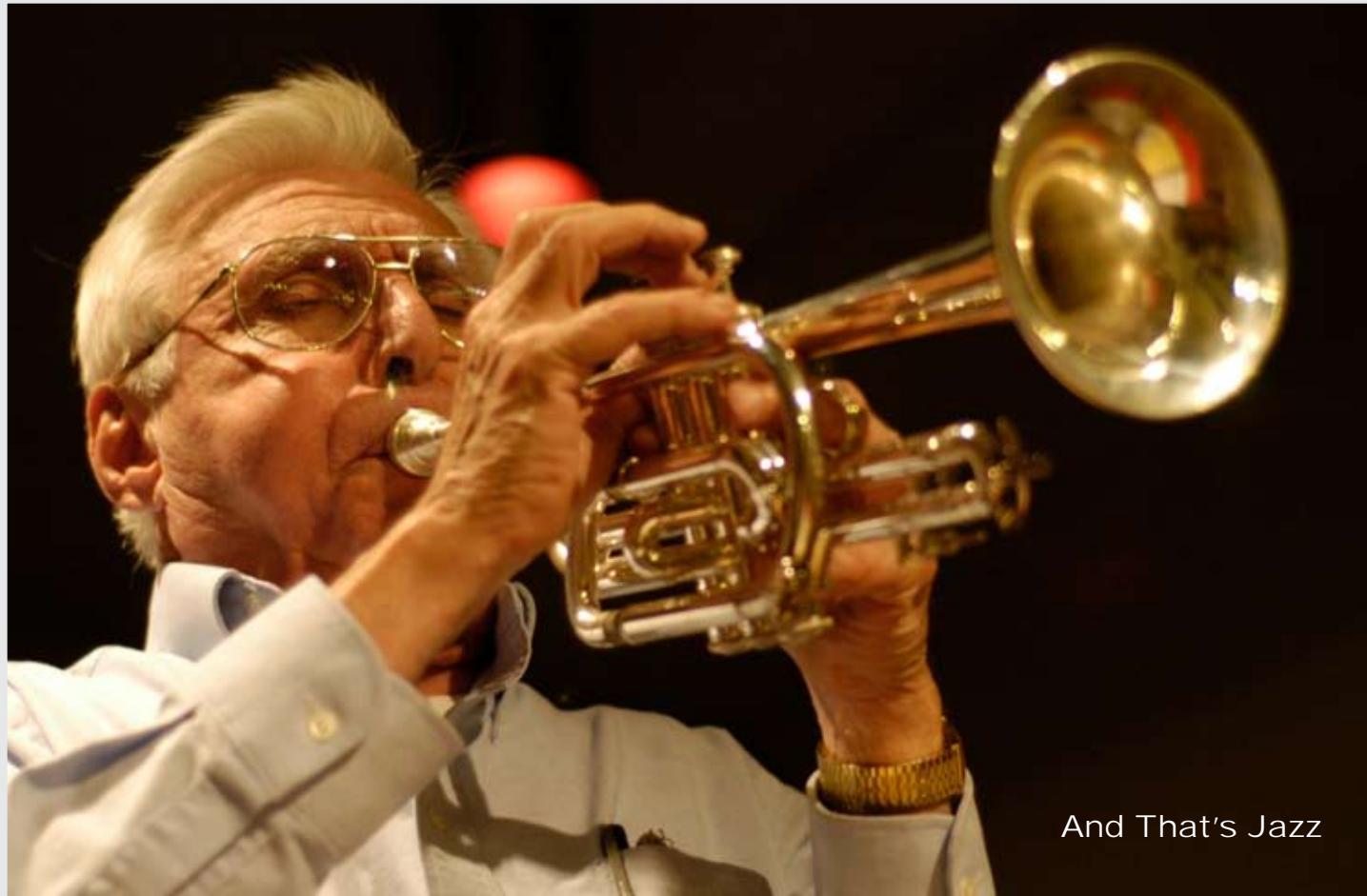
And That's Jazz