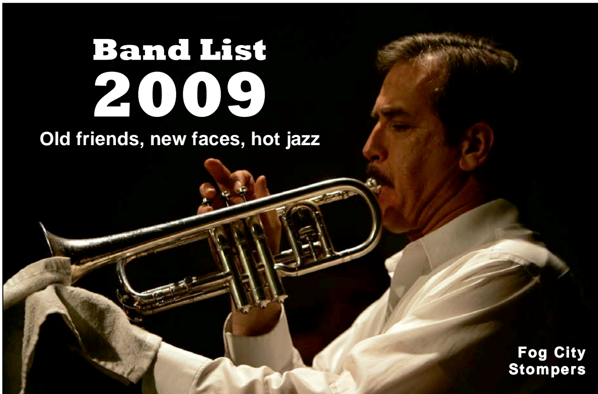
Fog City Stompers