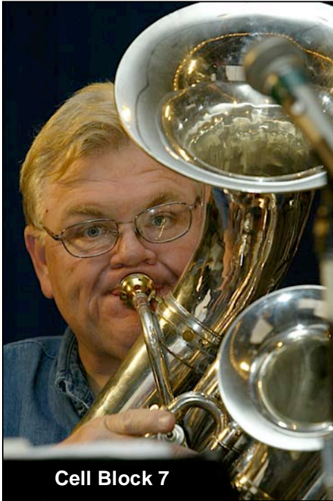
Cell Block 7