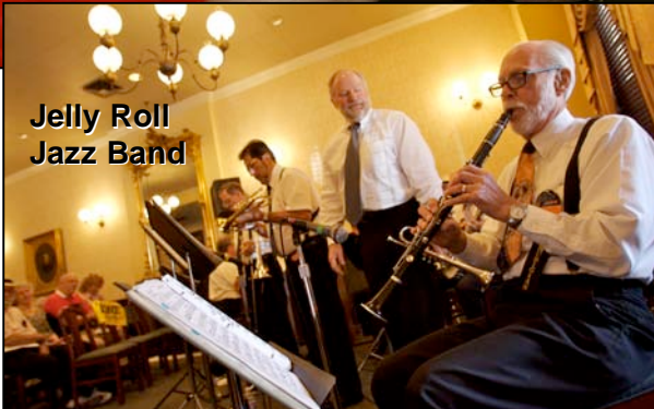
Jelly Roll Jazz Band

Stellar line-up features new faces – as well as a few familiar ones